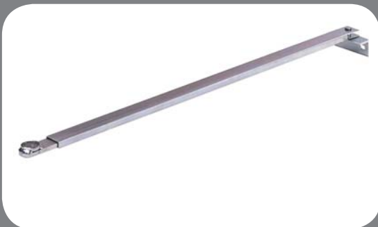
Telescopic arm option for bi-folding doors